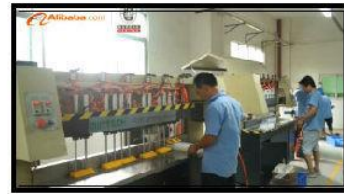
Diamond polish machine