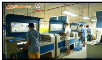
Laser engrave machine