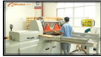
Auto cutting machine