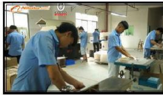
Trimmer and Drilling machine