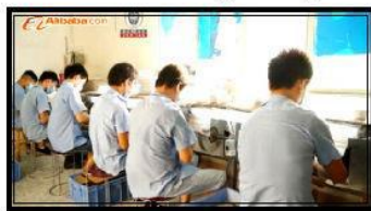
Cloth wheel polishing machine