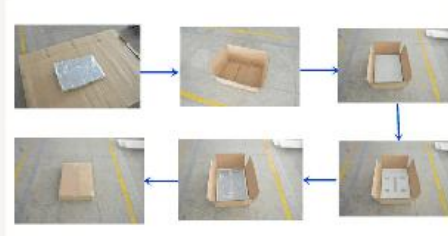
Safety Packaging: PE bag/ bubble bag + foam card + inner box + outer carton