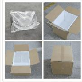
General Packaging: PE bag/ bubble bag + foam card + outer box